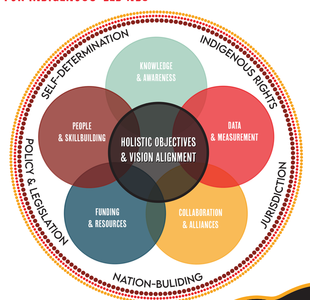
FIGURE 1. INTERSECTING CAPACITY NEEDS FOR INDIGENOUS-LED NBS

Central capacity gaps and needs we heard about are illustrated in Figure 1, below. A more detailed version of this graphic is available as an interactive tool at this weblink.